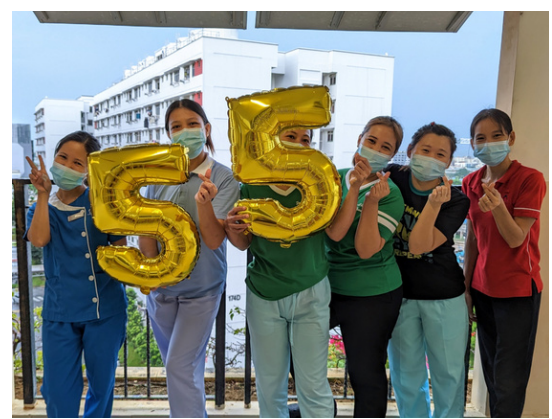
55th Anniversary Celebration with staff and residents