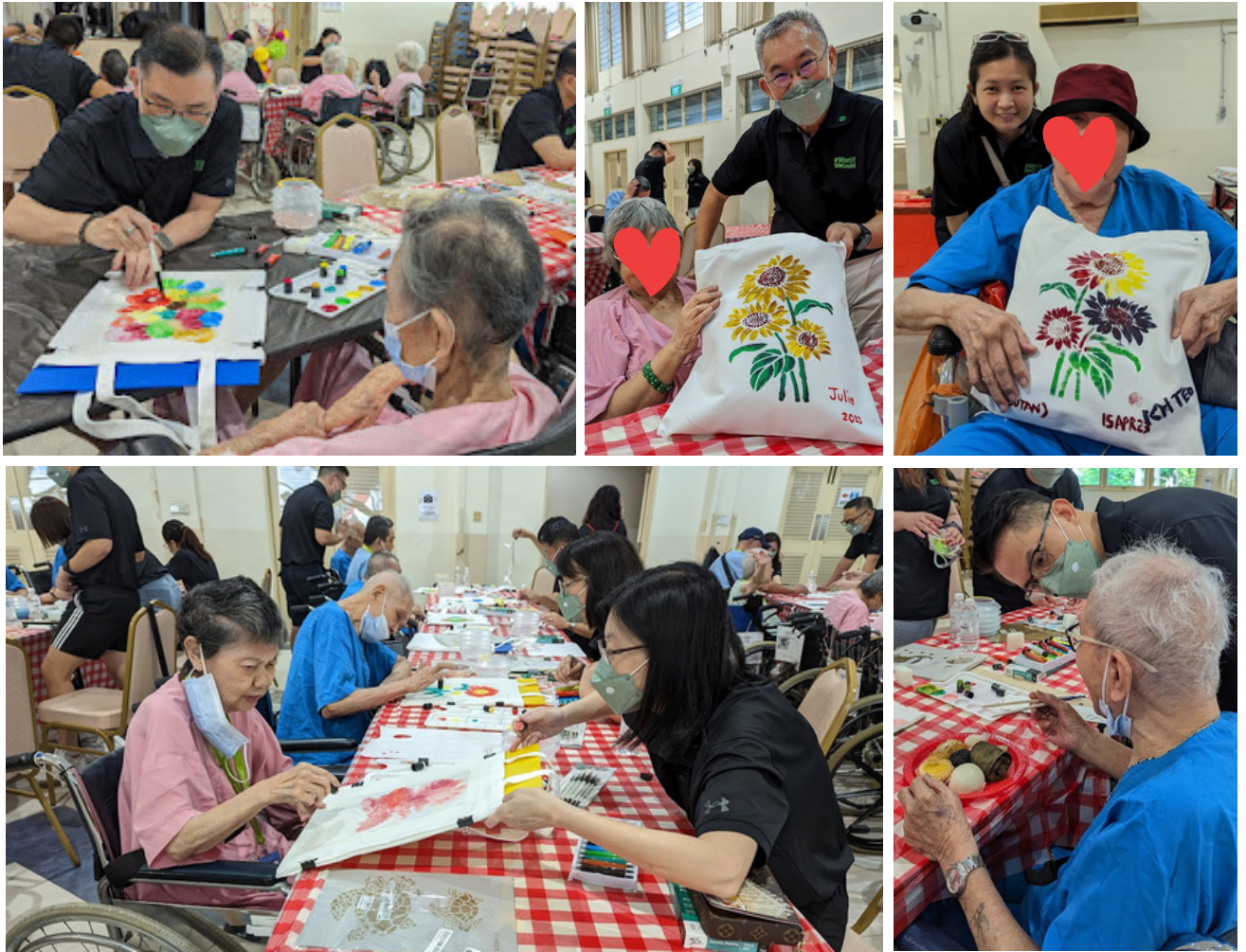
Corporate Volunteers from Cathay United Bank