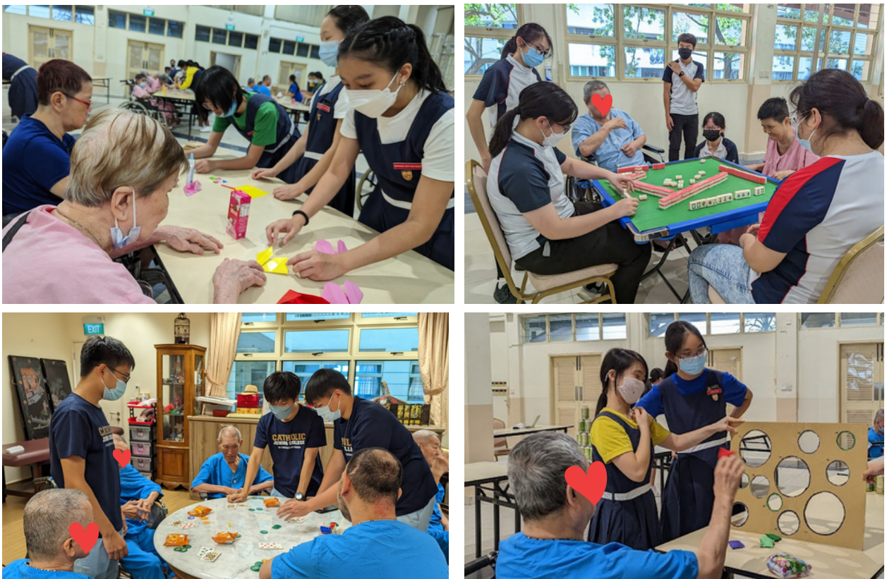
Student volunteers from various schools