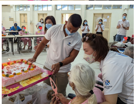
Mass Birthday Celebration with Tokio Marine staff