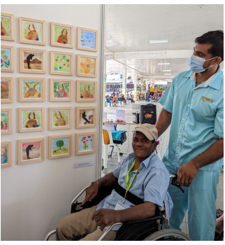
More photos from the Nagomi Art Exhibition & Workshop outing