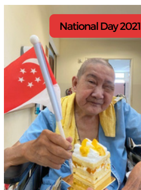
National Day 2021