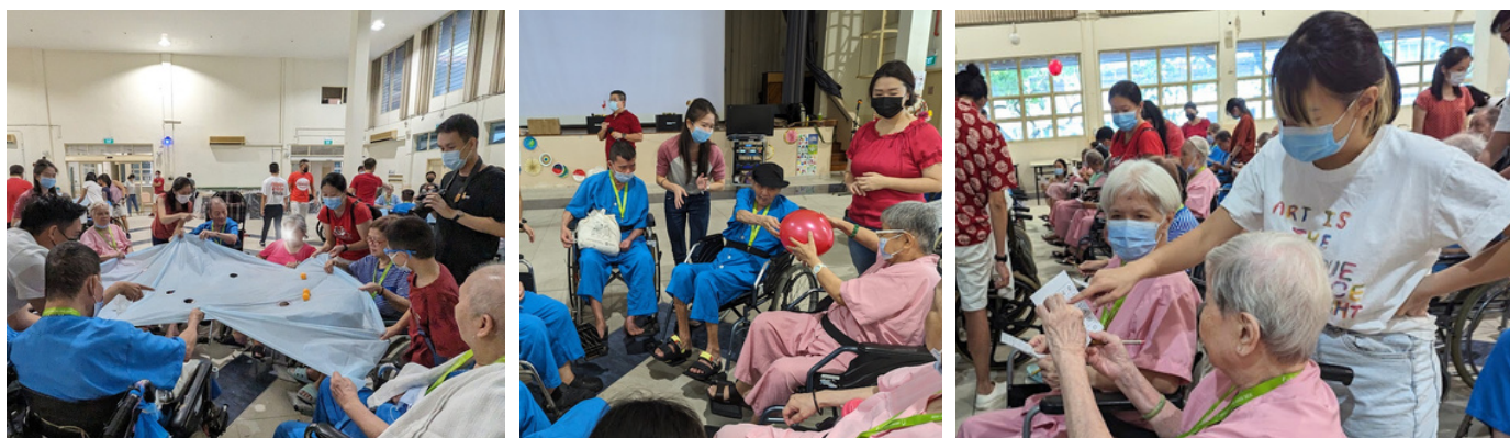
HIM Church engaging in activities with residents