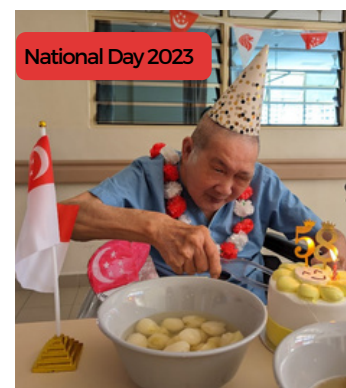
National Day 2023