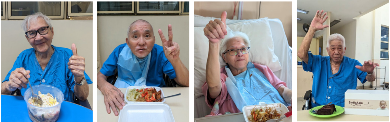
Project Makan (food sponsors/donations) for our residents!