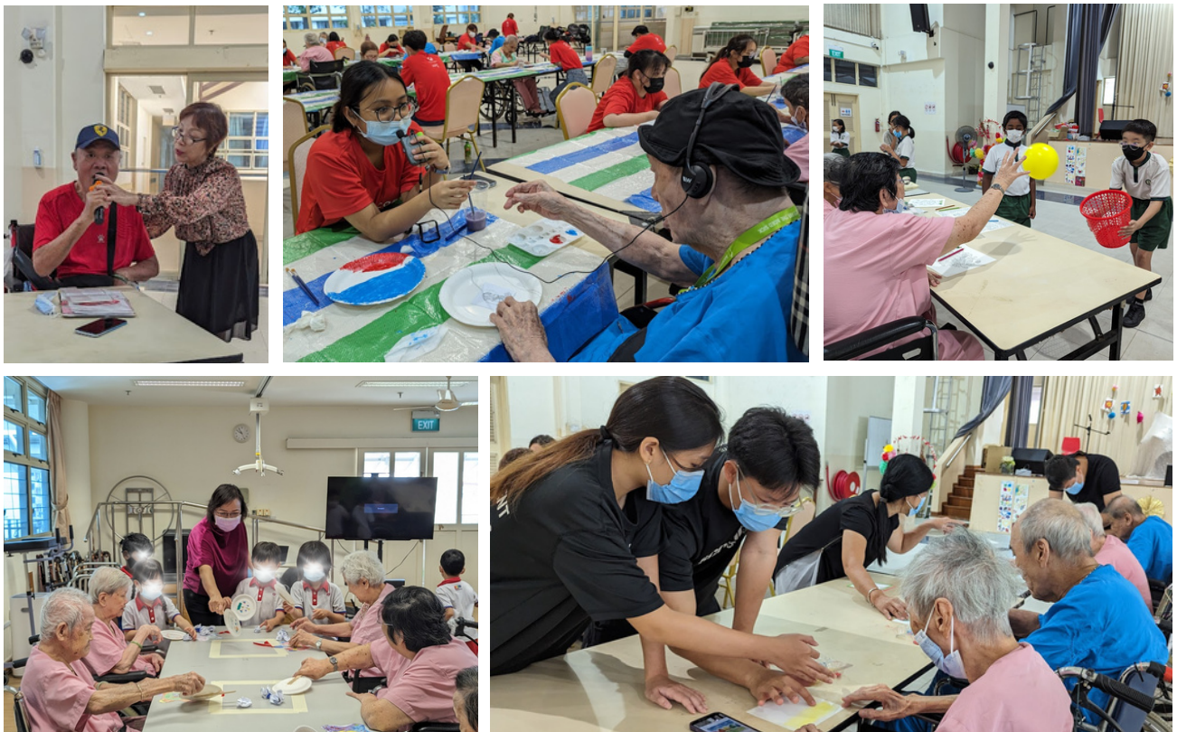
Photos from volunteer groups and schools