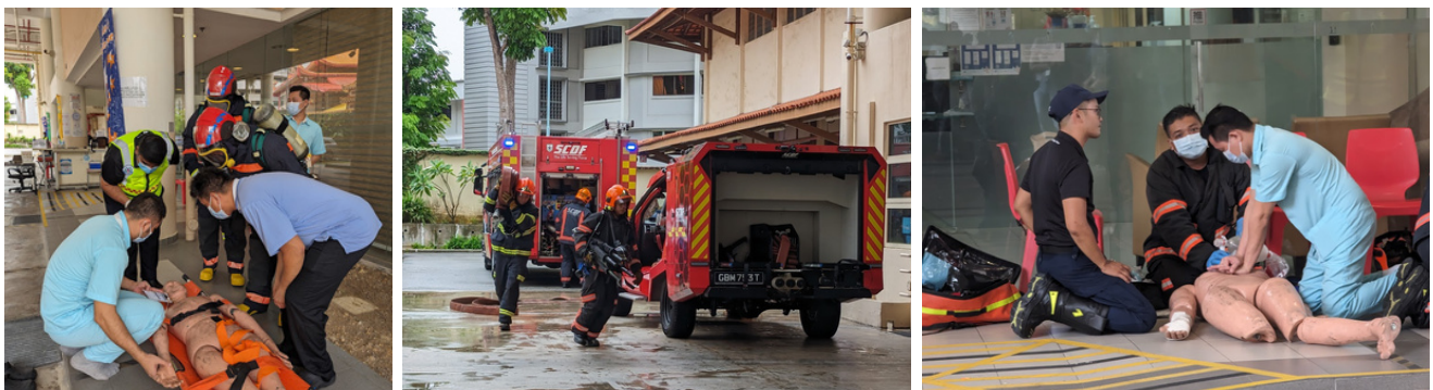
Fire Drill in collaboration with SCDF