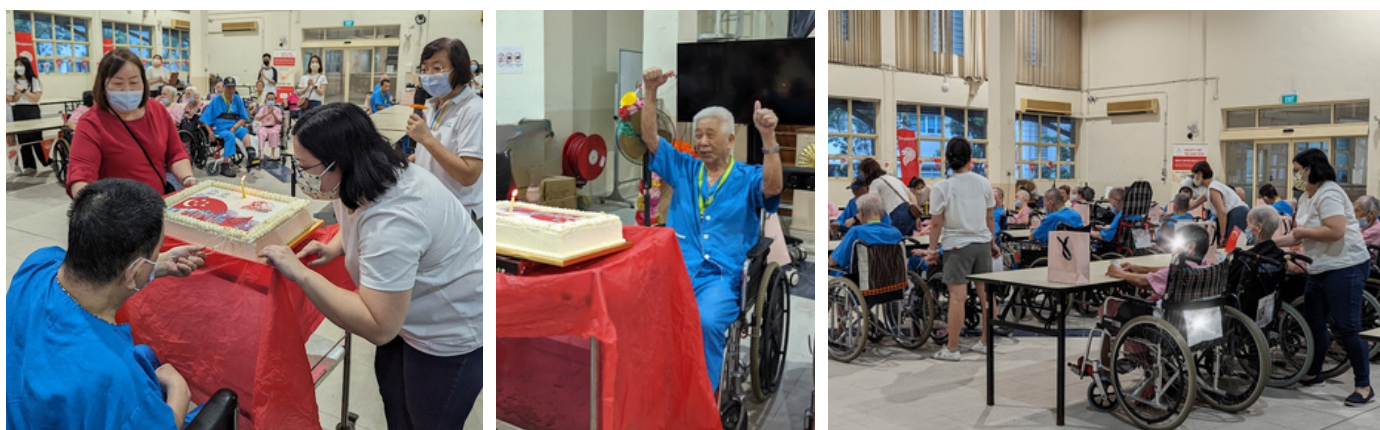
Mass Birthday and NDP celebration with GBI (in collaboration with Zeles and Aces Care)