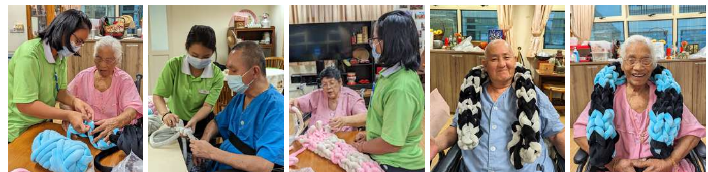
BTS: Preparing for Appreciation Night 2023 Finger crocheting using chunky yarn