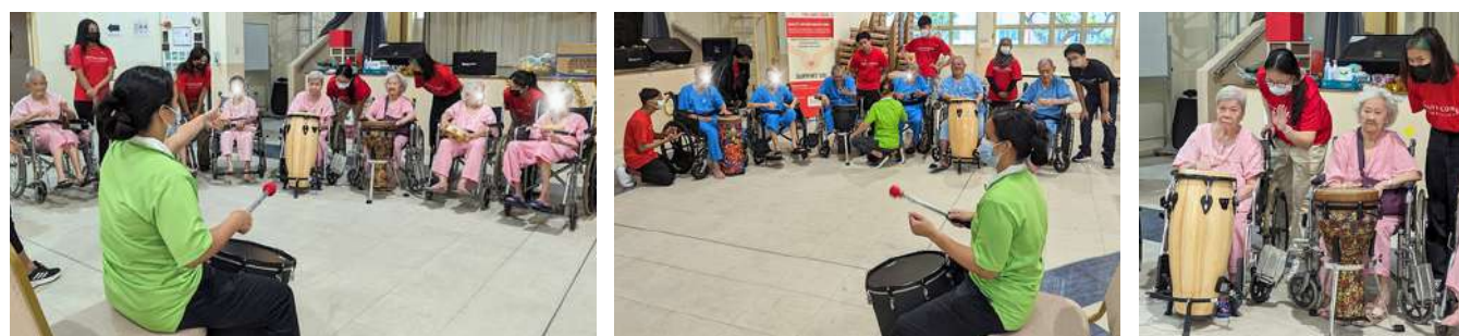
Youth Corps volunteers helping with our Rehab's Drumming session