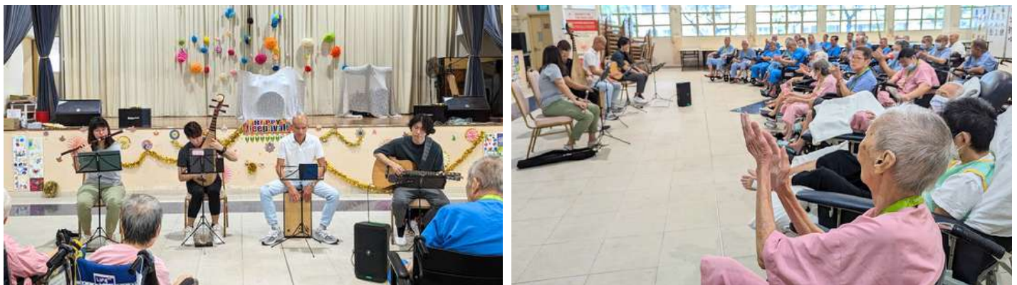
Teng Company's ensemble returns to SAS for the second time!