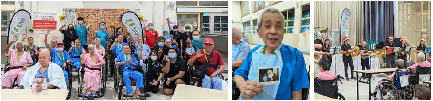
NTUC Club visits with a Ukulele group and Santa Claus!