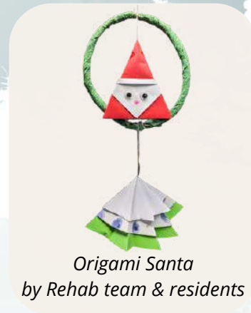
Origami Santa by Rehab team & residents