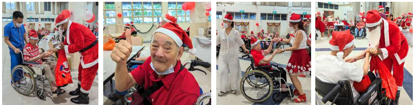
Betty's Fabulous Volunteers Club's Christmas Party